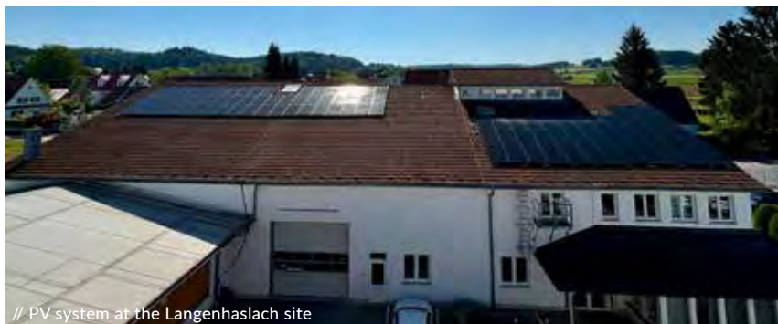
// PV system at the Langenhaslach site