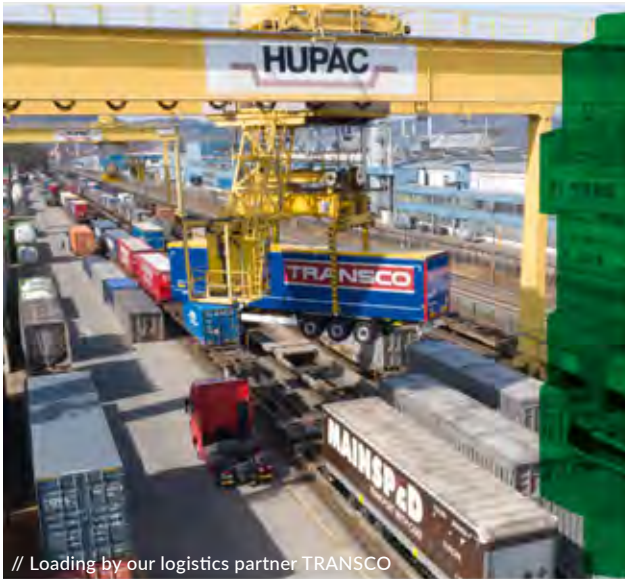
// Loading by our logistics partner TRANSCO