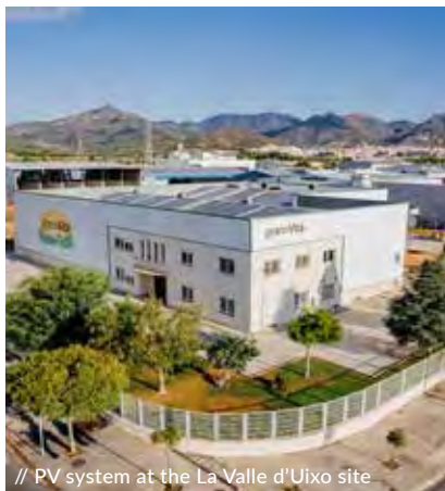
// PV system at the La Valle d'Uixo site