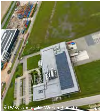
// PV system at the Werkendam site